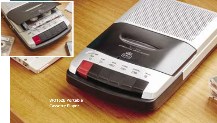
WO162B Portable Cassette Player