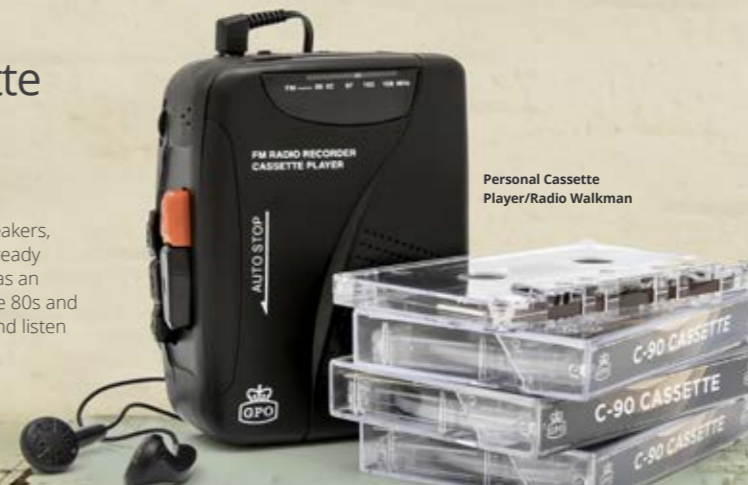
Personal Cassette Player/Radio Walkman

Battery powered and with built-in speakers, just plug in your cassette and you're ready to go. The portable cassette player was an iconic piece of kit for music fans in the 80s and 90s. Play tapes or use the FM radio and listen through your headphones.