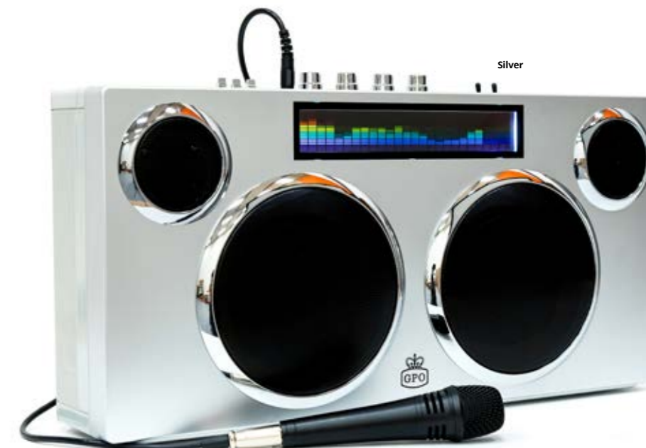
GPO Manhattan Silver