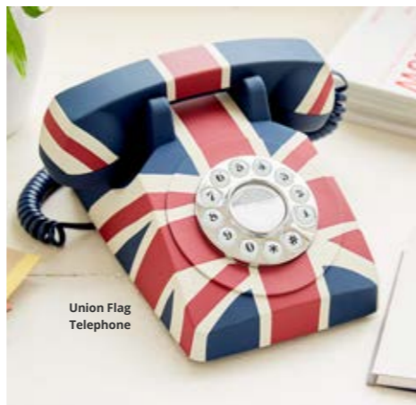
Union Flag Telephone