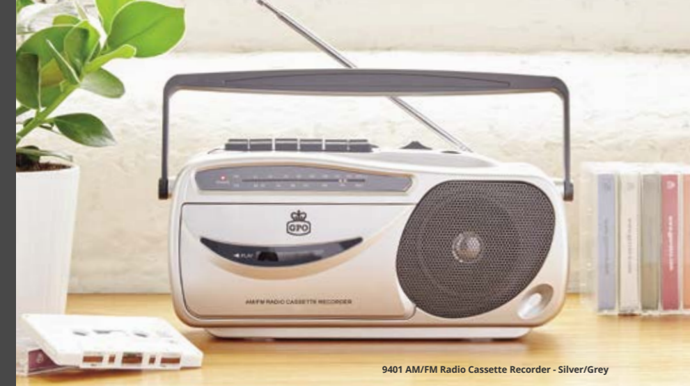
9401 AM/FM Radio Cassette Recorder - Silver/Grey