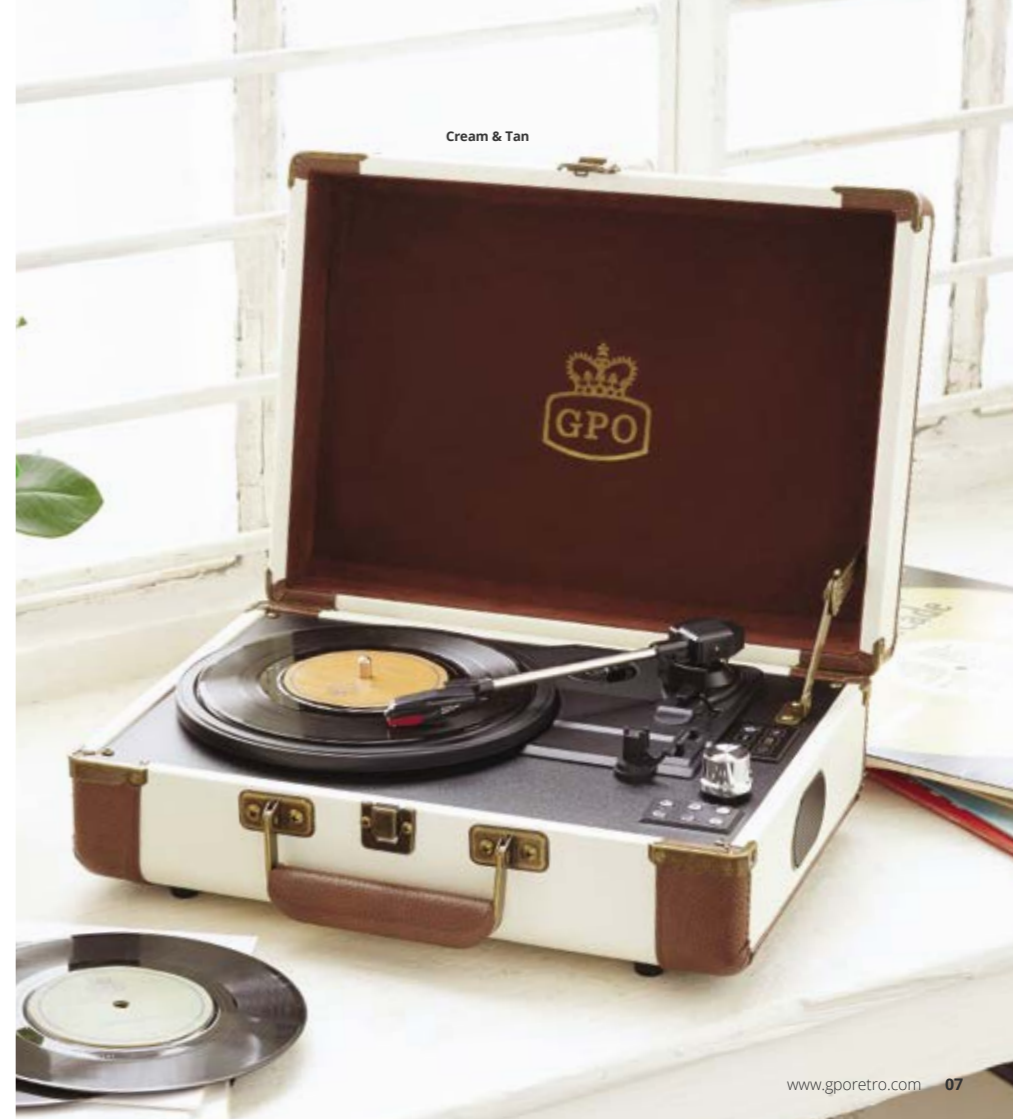
Cream & Tan