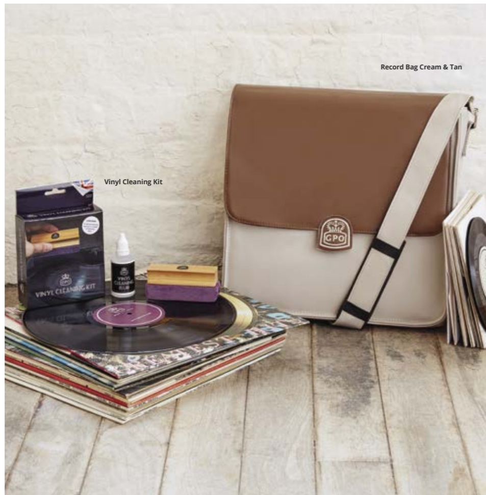
Vinyl Cleaning Kit