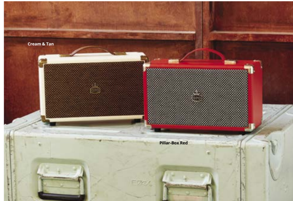
Cream & Tan