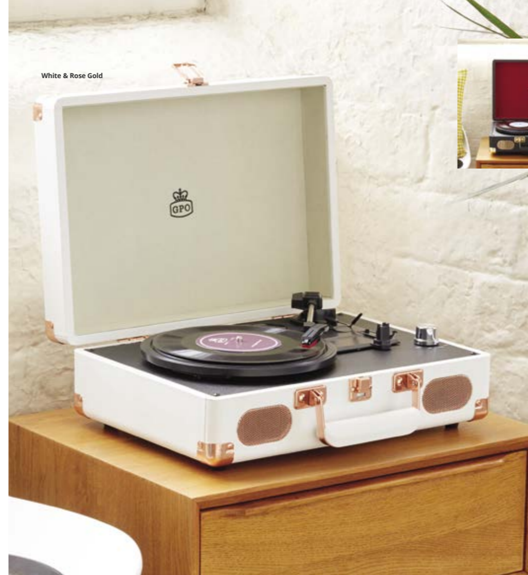
White & Rose Gold