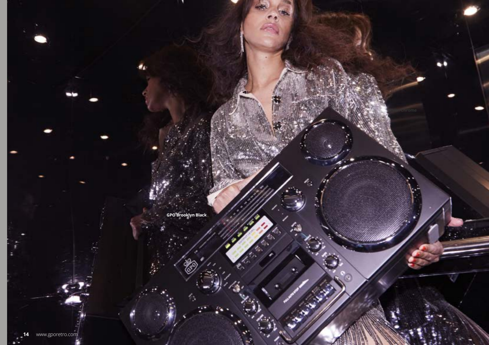
GPO Brooklyn Black