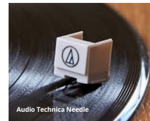
Audio Technica Needle

Available for all GPO turntables. Please indicate turntable model when ordering.