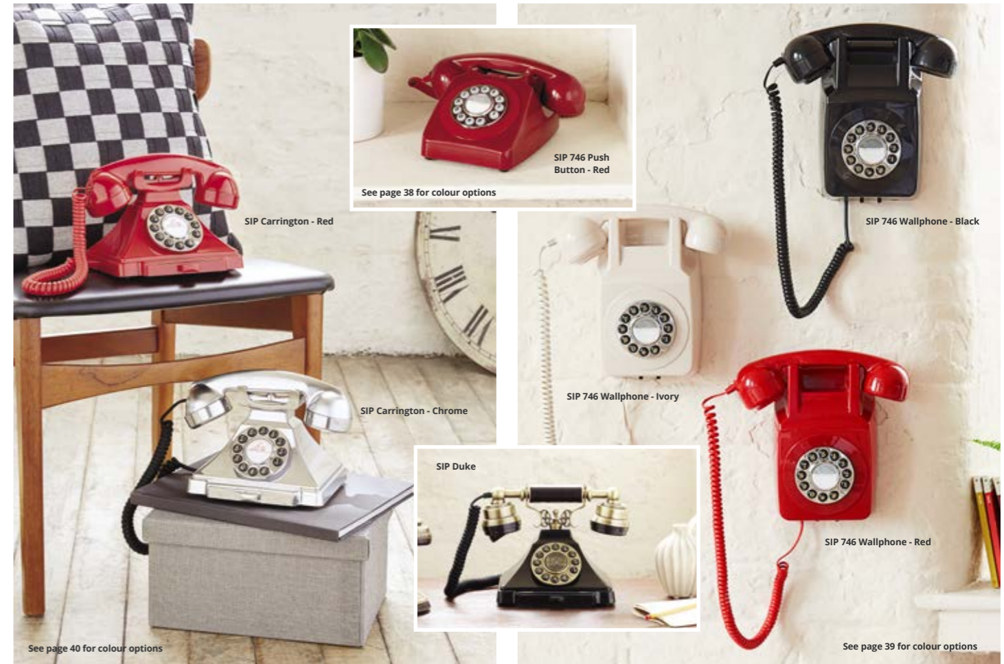
SIP Carrington - Red

Bespoke Sample GPO 200 phone for Hospitality Customers. Please ask your account manager for details