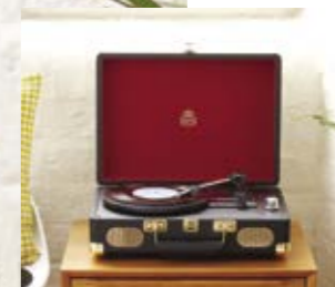
Black & Gold