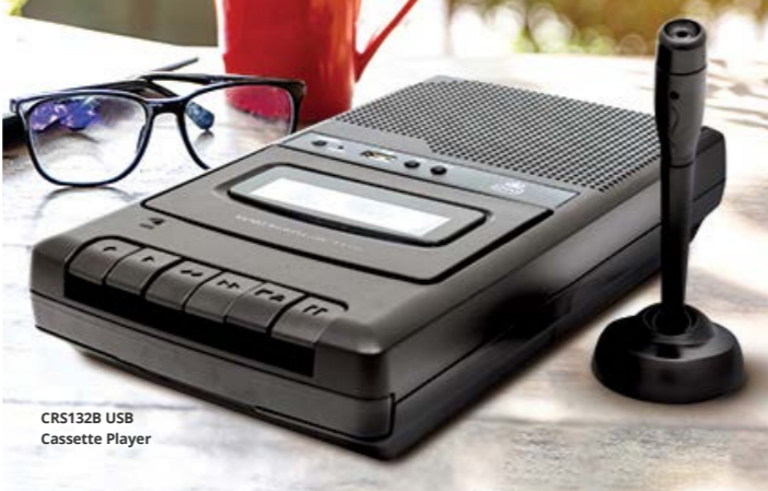
CRS132B USB Cassette Player