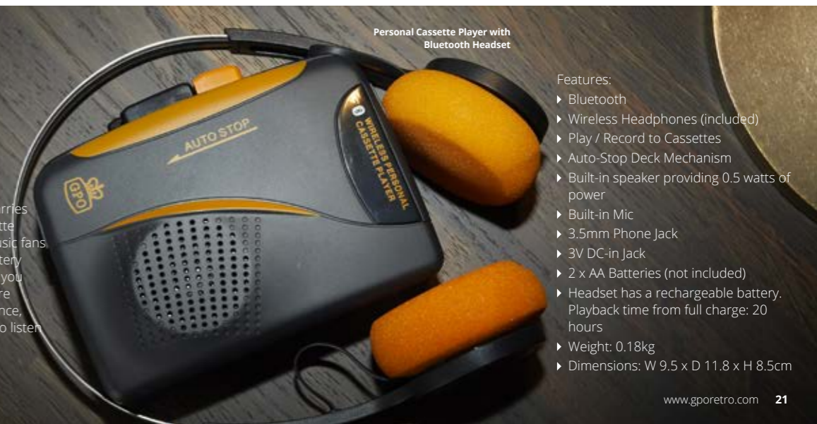
Personal Cassette Player with Bluetooth Headset

Another GPO unit that successfully marries retro and modern. The portable cassette player was an iconic piece of kit for music fans in the '80s and '90s. This version is battery powered and has built-in speakers, so you can just plug in your cassette and you're ready to go. For the ultimate convenience, the Bluetooth headphones allow you to listen without getting tangled in wires.