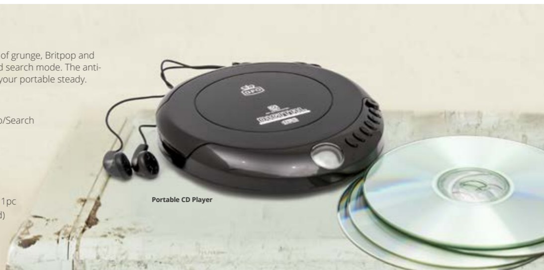
Portable CD Player