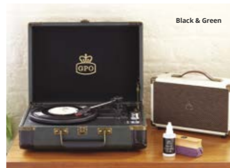
Black & Green