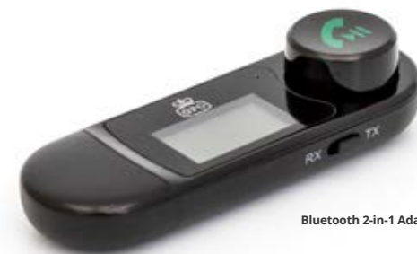
Bluetooth 2-in-1 Adaptor